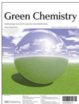
Image reproduced by permission of Scott Spear Green Chem. , 2005, (7)